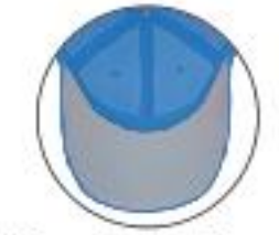
Gray Under Visor