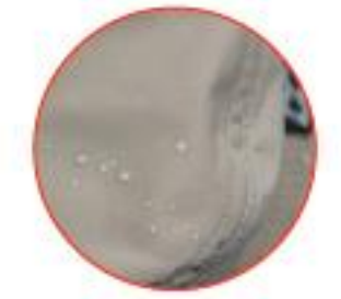
Durable water repellent finish