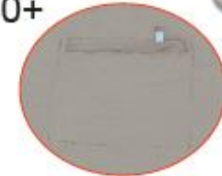
With hidden pocket