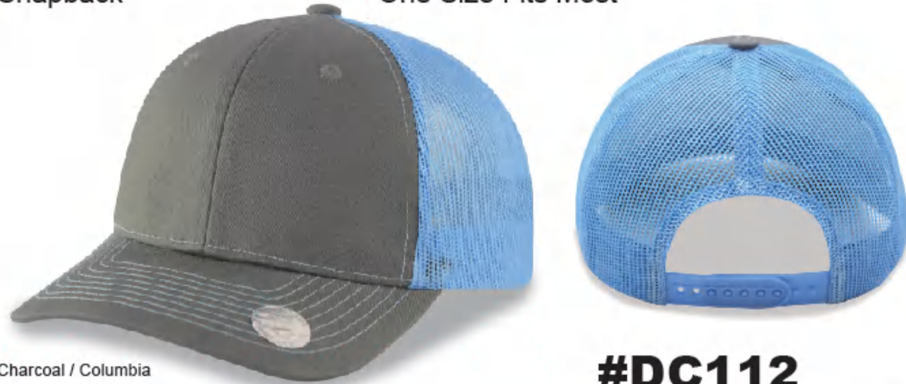
Charcoal / Columbia