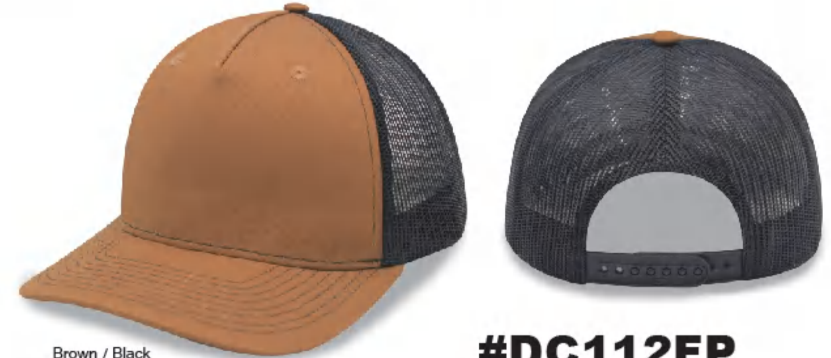
Brown / Black