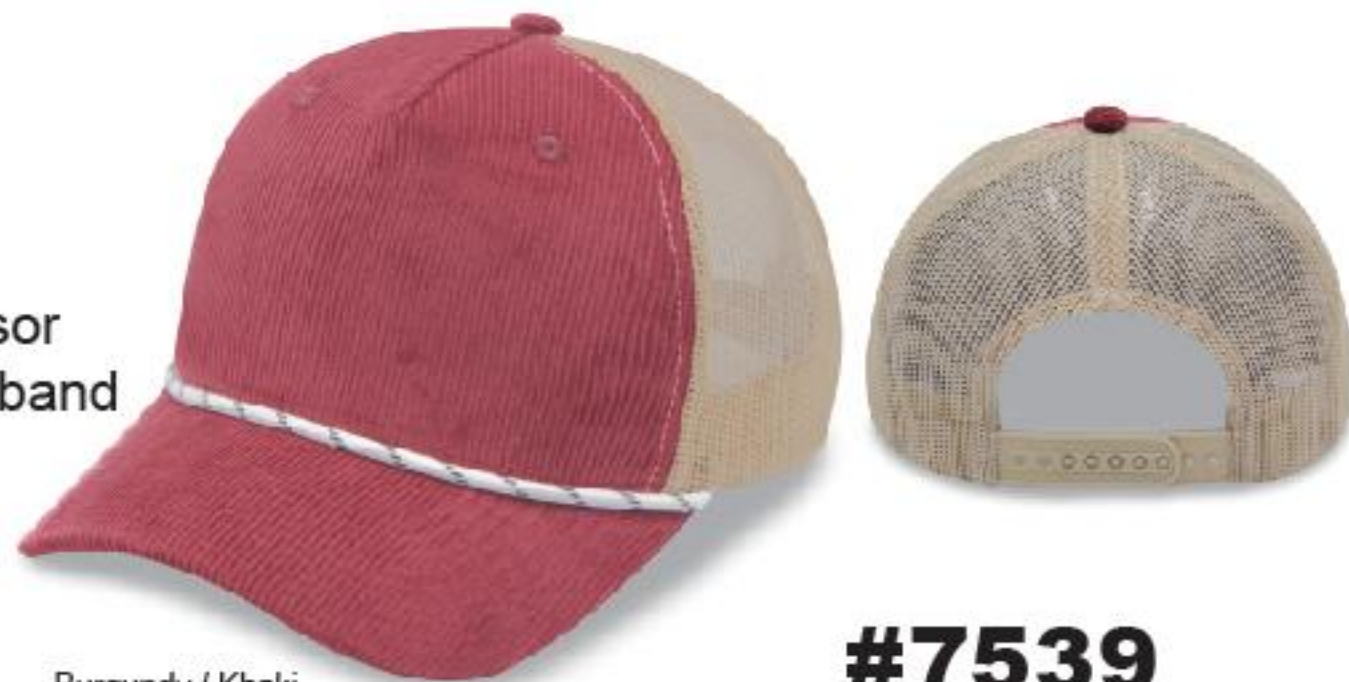
Burgundy / Khaki