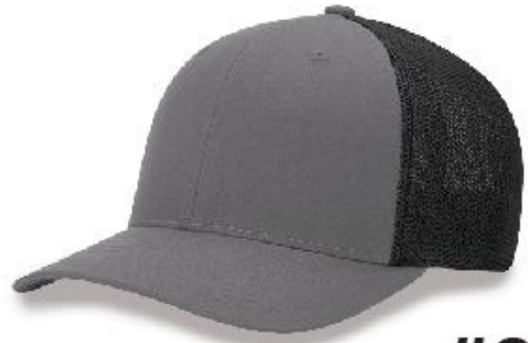
Charcoal / Black