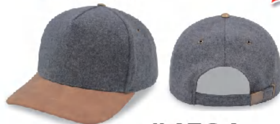
Gray / Brown