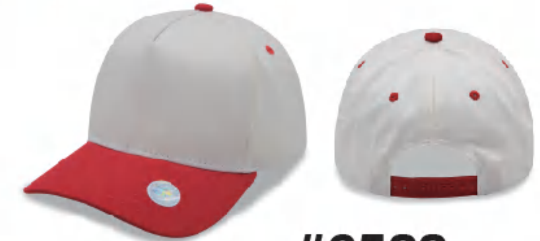
Stone / Red