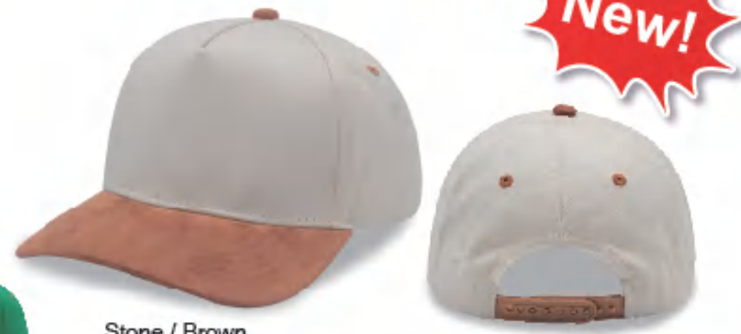
Stone / Brown