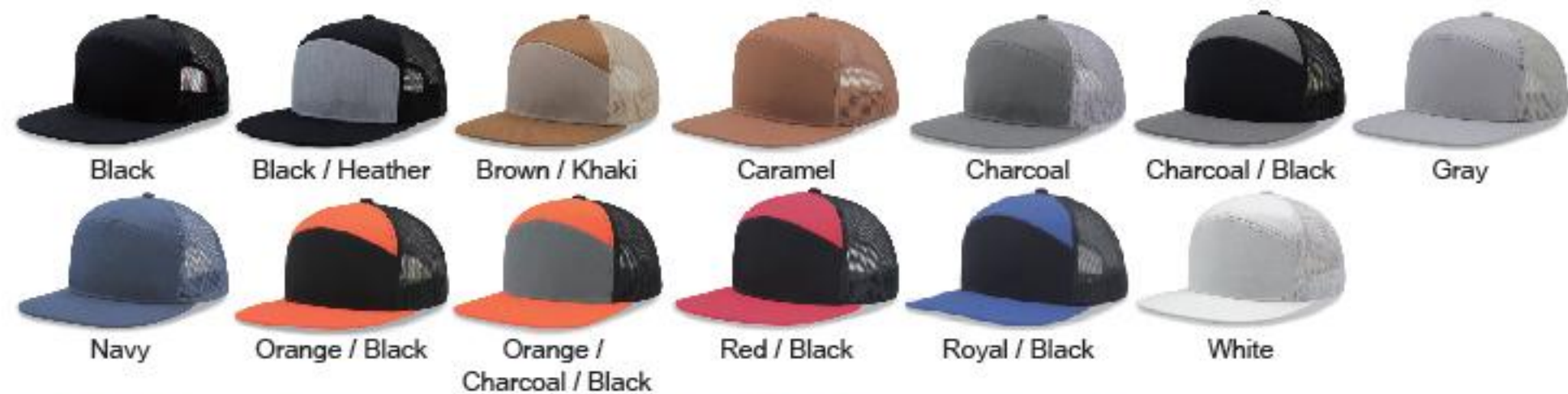
Black Black / Heather Brown / Khaki Caramel Charcoal Charcoal / Black Gray