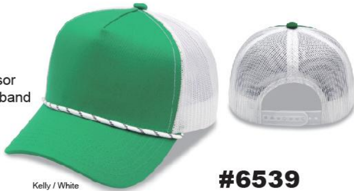
Kelly / White