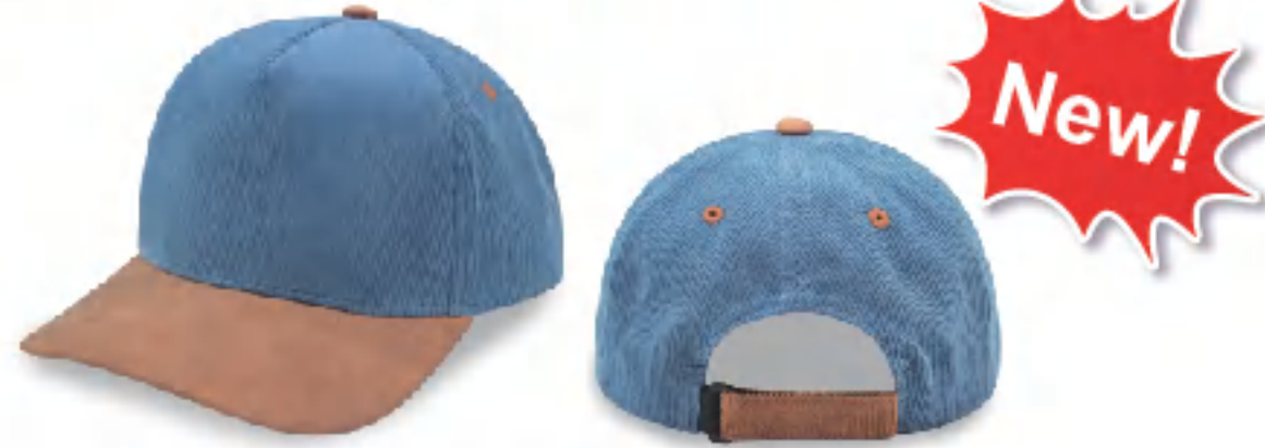
Slate Blue / Brown