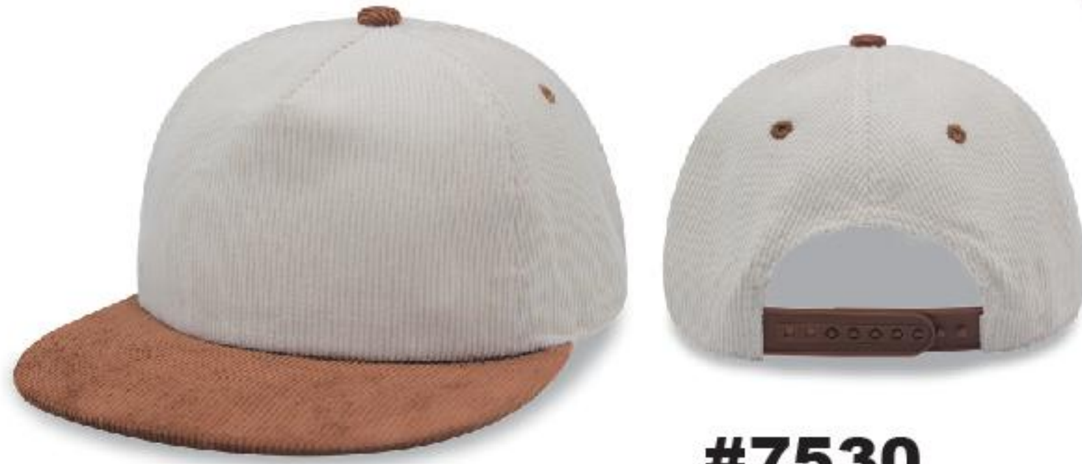
Stone / Brown