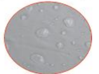
Durable water repellent finish