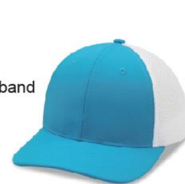
Sky Blue / White