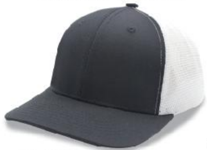
Black / White