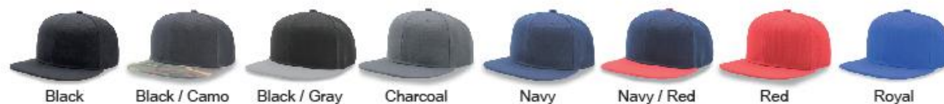
Black Black / Camo Black / Gray Charcoal Navy Navy / Red Red Royal