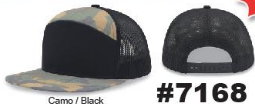
Camo / Black