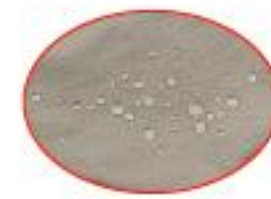
Durable water repellent finish