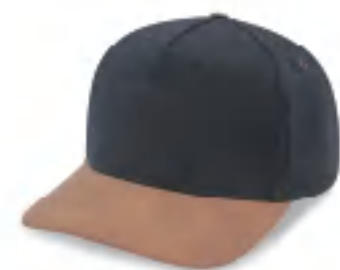
Black / Brown