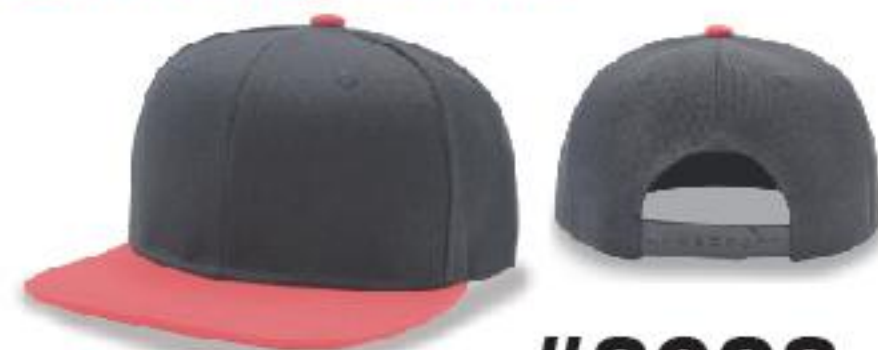
Black / Red